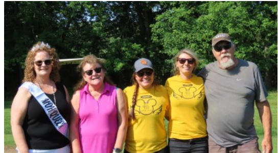
Minnie Mouse team